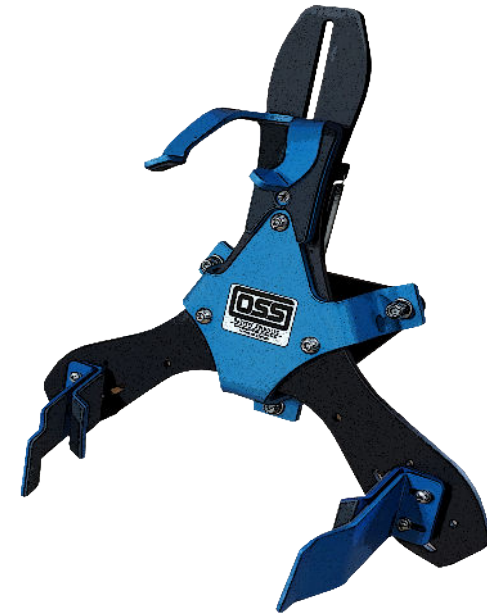
Talon Mounting Bracket