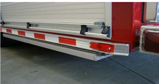
(Pull Out Step Shown Below Rail - Not Included)